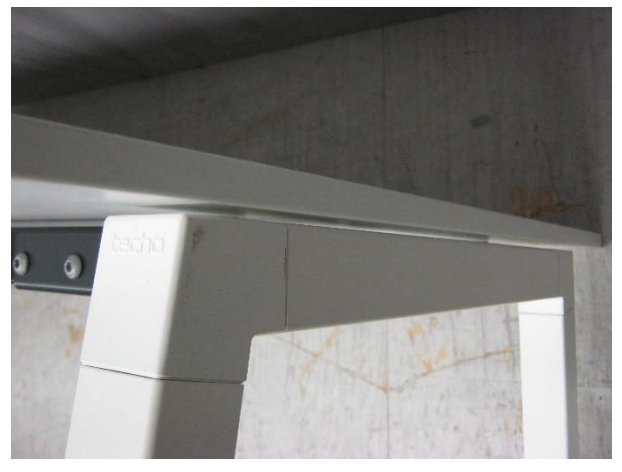
Photo 5: Tested sample 220609-3 of Techo Fount Classic A-Leg - detail office desk top to legs side view

Report code: 22.0609-3 Date: May 3, 2023 Page: 8/14