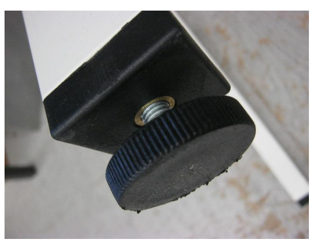
Photo 6 : Tested sample 220609-3 of Techo Fount Classic A-Leg - detail final leveller