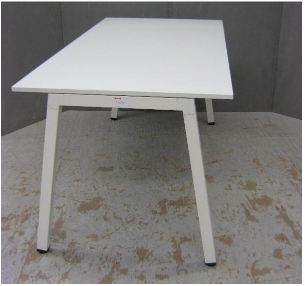
Photo 2 : Tested sample 220609-3 of Techo Fount Classic A-Leg - side view