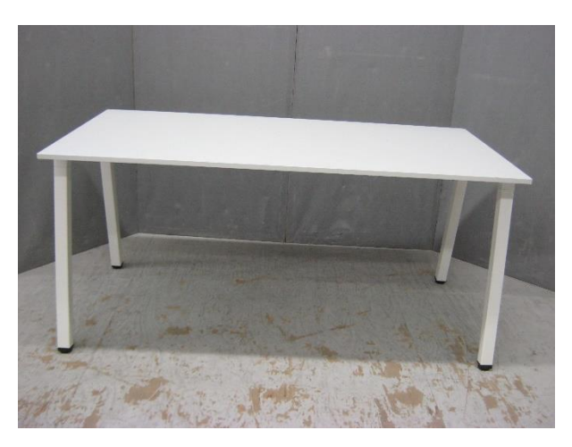
Photo 1 : Tested sample 220609-3 of Techo Fount Classic A-Leg - front view