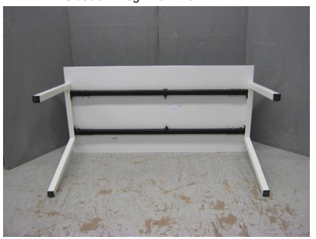
Photo 3 : Tested sample 220609-3 of Techo Fount Classic A-Leg - bottom view