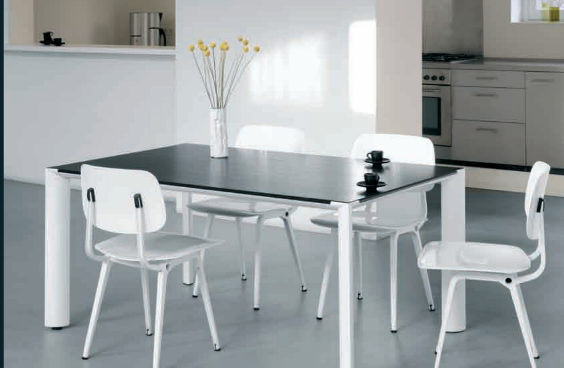
Ahrend 1030: 220x140cm, Ciranol natural beech tabletop, light grey frame. Ahrend 350: conference chairs. Ahrend 1030: 180x90cm. White Ciranol worktop, white frame. Revolt.