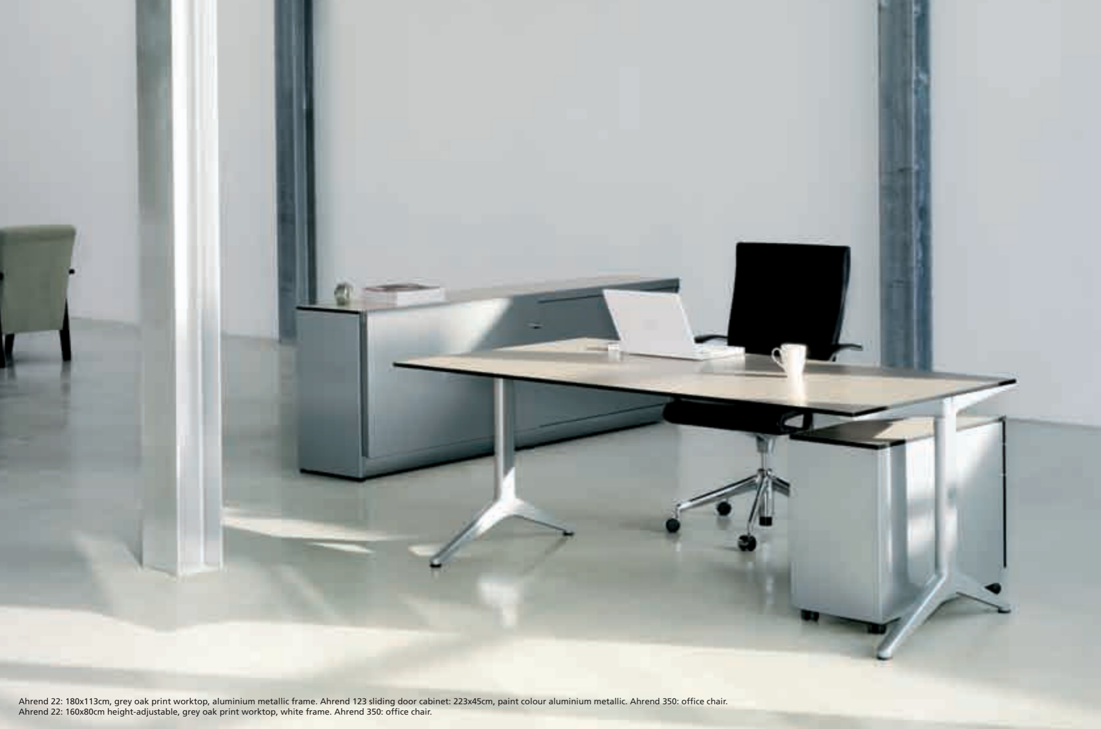
Ahrend 22: 180x113cm, grey oak print worktop, aluminium metallic frame. Ahrend 123 sliding door cabinet: 223x45cm, paint colour aluminium metallic. Ahrend 350: office chair.