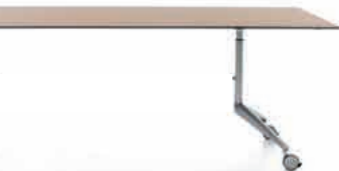
Bas Pruijser Designer Ahrend 22